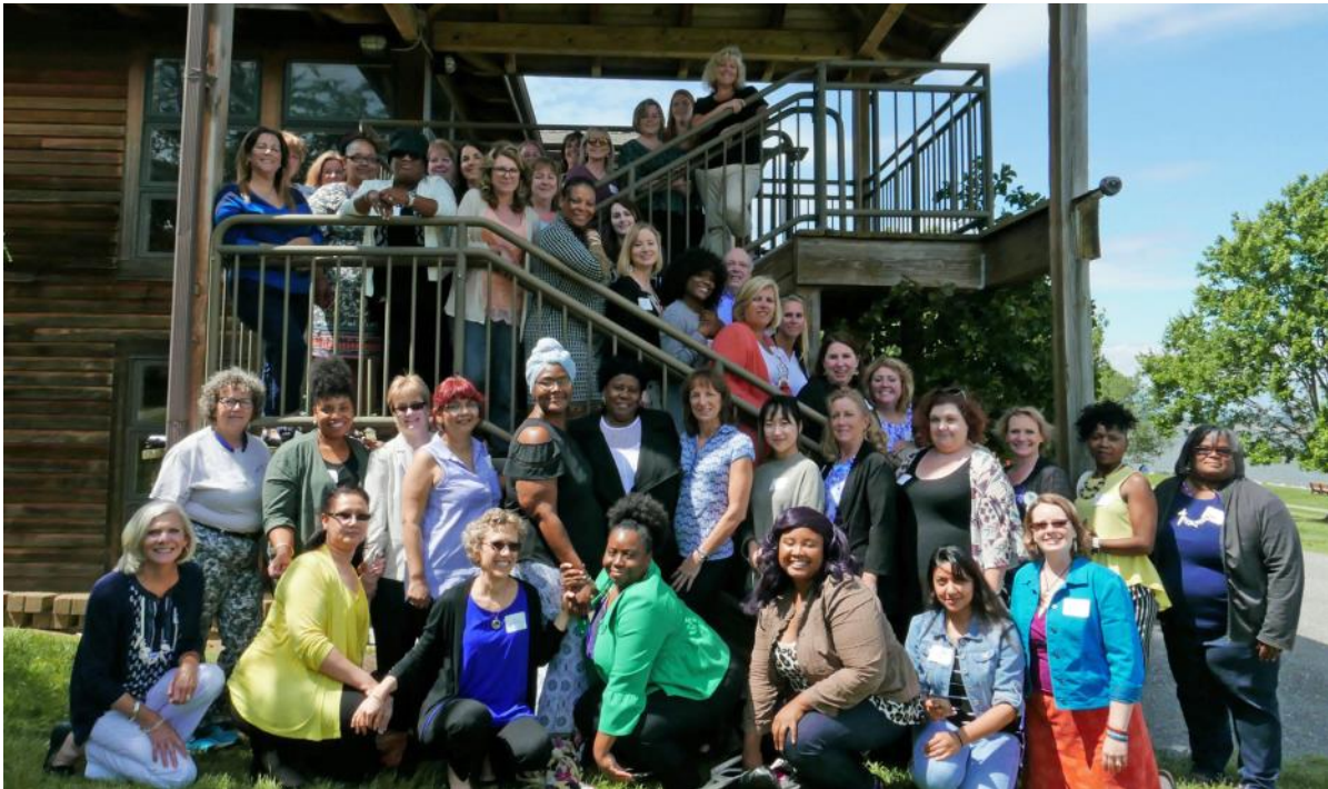
Photo taken June 7, 2017. Please visit www.mdcoaliton.org for a staff directory.